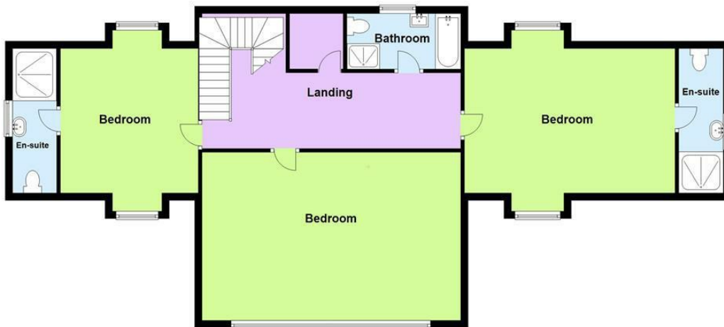
Illustrative details only - not to scale

From our Haverfordwest Office continue up High Street, onto Dew street, Straight over at the traffic lights and onto the roundabout. Take the third exit down Merlin's Hill. At the next roundabout take the second exit up Pembroke Road and continue on this road to Burton for approximately 6.5 miles. At the bottom of the hill you will see the Jolly Sailor restaurant and Kiln Road is the road leading along the waters edge to the left. The plot will be found on your right, identified by our board.